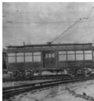
STREETCAR EXPRESS —In the 1910s, Wells Fargo express street cars delivered customers' business throughout Los Angeles with stops in Beverly Hills and Santa Monica.