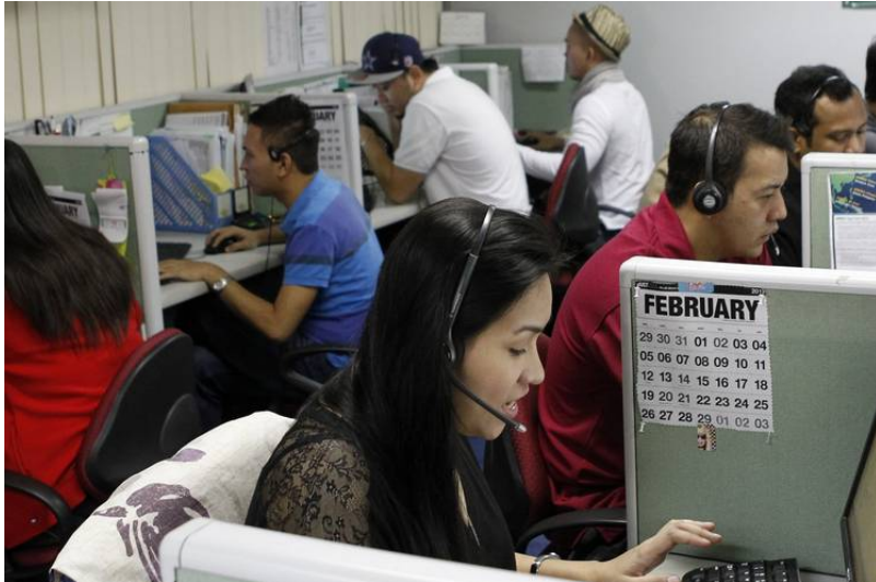
As technology improves, an increasing number of the Philippines' 1.2 million call-center workers, such as those shown above in Manila in 2012, will be at risk of having their jobs outsourced to customer-service robots.